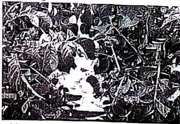
Fig. 2: Another section of Jane's potato garden.